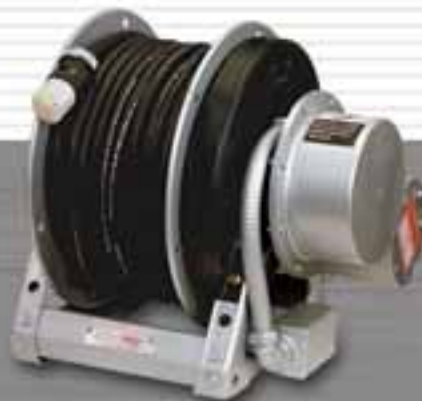
ECR 1600 Series