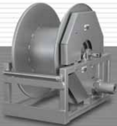
Custom HD 6000 Series

Hannay Reels. The Industry Leader. The Quality Choice.