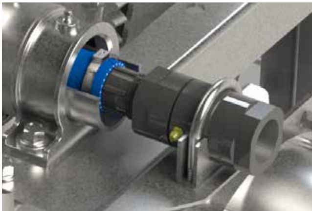
Close-up of CPVC swivel, clamp and mounting bracket.