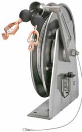
Model HGR50 (Shown with optional "Y" branch)