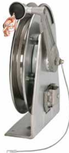
Model SSHGR50 (Optional unpolished stainless steel HGR50)