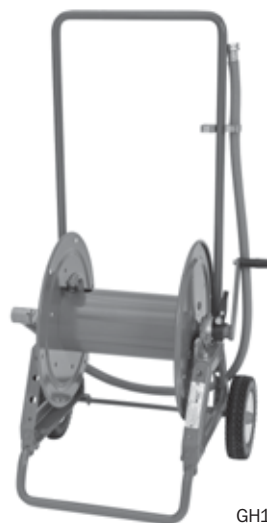
GH1100 configuration shown