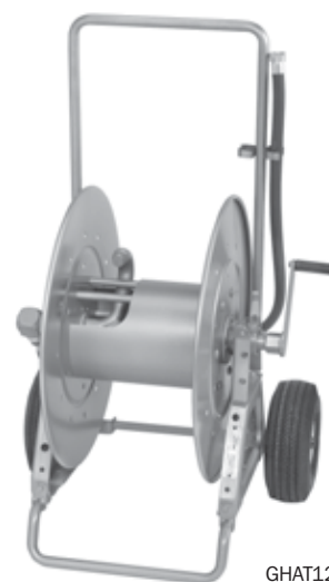
GHAT1200 configuration shown