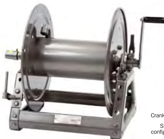
Crank rewind Standard configuration shown