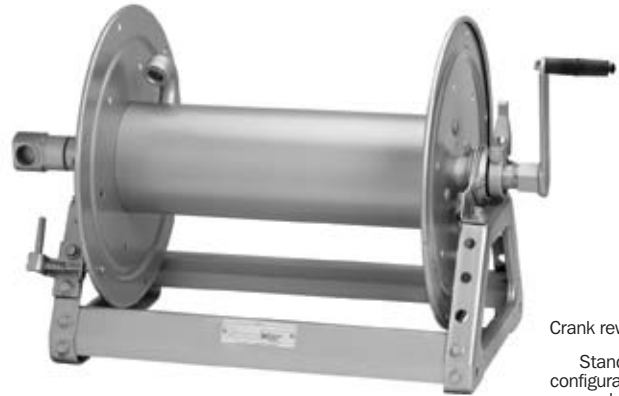
Crank rewind Standard configuration shown