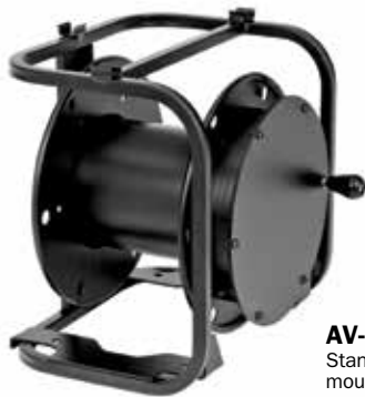
AV-1 Standard with caster mounting plates