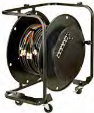
AV-2 Shown with optional casters (cable and punched end plate not included)